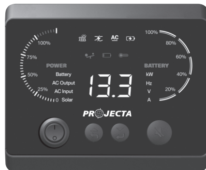
LBM-BT Lithium Battery Monitor